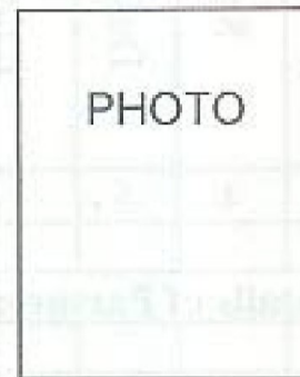
Person who gave test of WM repairing