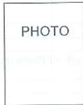
Person who gave test of WM repairing