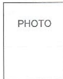
Person who gave test of WM manufacturing