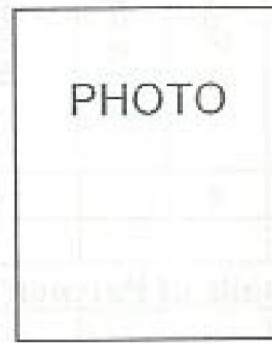
Person who gave test of WM manufacturing